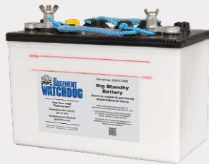
30HDC140S or BW-30F