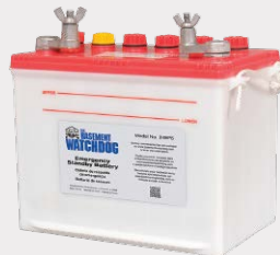
24EP6 or BW-24F