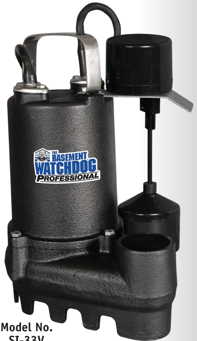
Model No. SI-33V